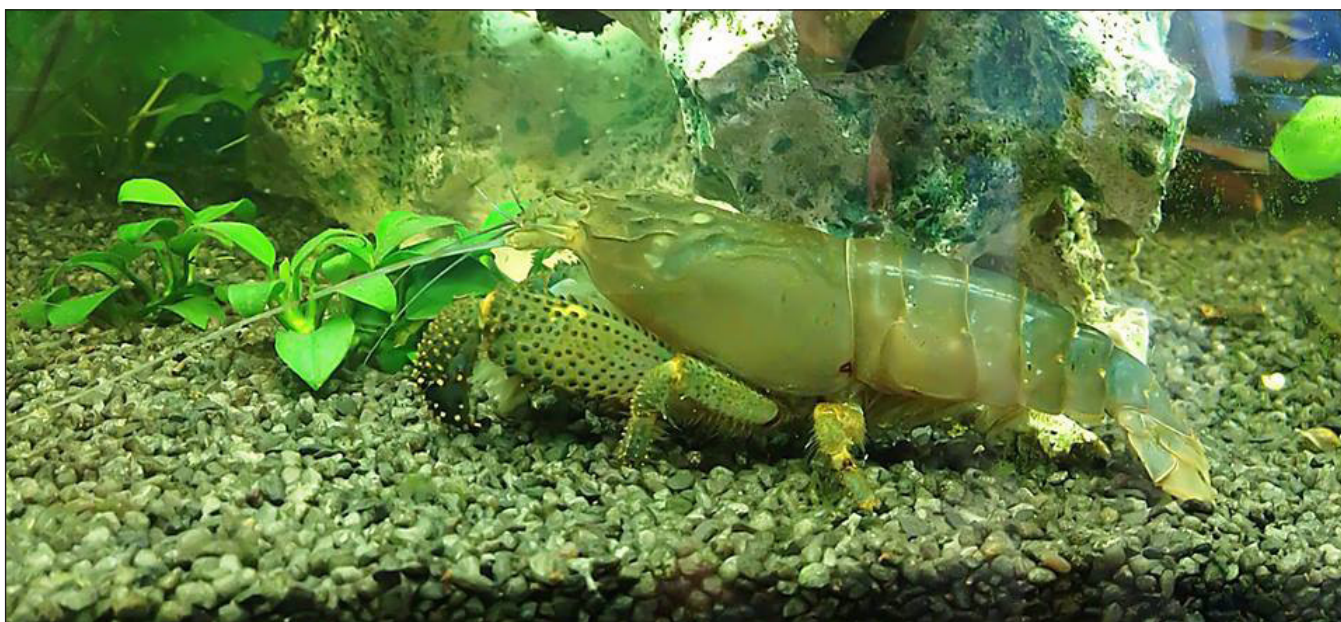
Figure 1. Atya gabonensis , viper shrimp, adapts to changing salinity, not low levels of DO. The back appendages on the abdomen are swimmerets, or pleopods, which function in swimming. The front appendages on the thoracic segment are for walking, called pereopods. The claw adaptation used for grasping rocks is significantly larger in the adult male and is used for sex identification.