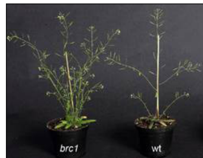
Figure 1. Shoot branching phenotype of a brc1 loss-of-function mutant. wt, wild type plant.