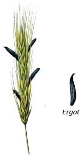
Figure 2. Ergot

Question 3: After reading Parts II and III of the case study, develop a second hypothesis, different from your first, explaining the events at Salem. Record this hypothesis on your data management sheet.