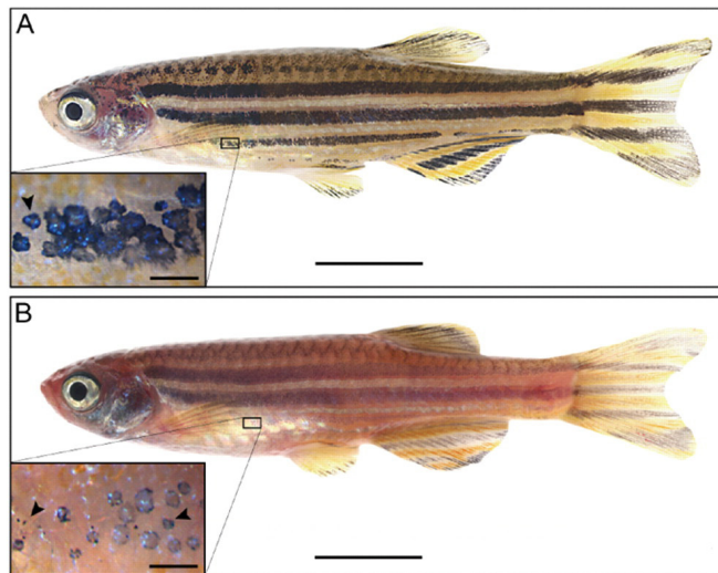
Figure 1. Panel A is a picture of a black-striped zebrafish with more melanocytes. Panel B shows a golden zebrafish with fewer melanocytes. From: Lamason, R.L., et al. 2005. SLC24A5, a putative cation exchanger, affects pigmentation in zebrafish and humans. Science 310(5755): 1782–6. Reprinted with permission from AAAS.